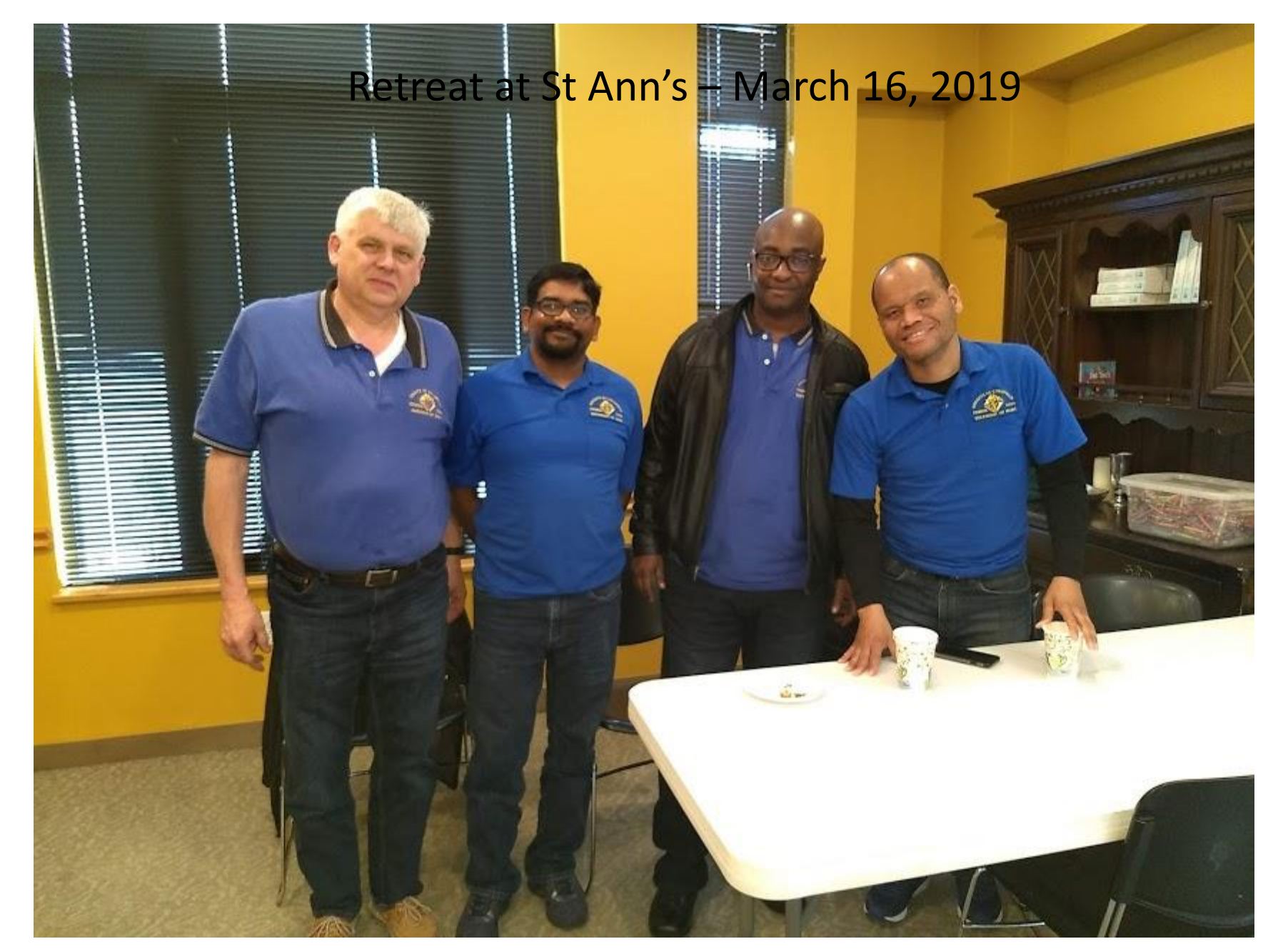
March 16 at St Ann's in Lawrenceville. Retreat