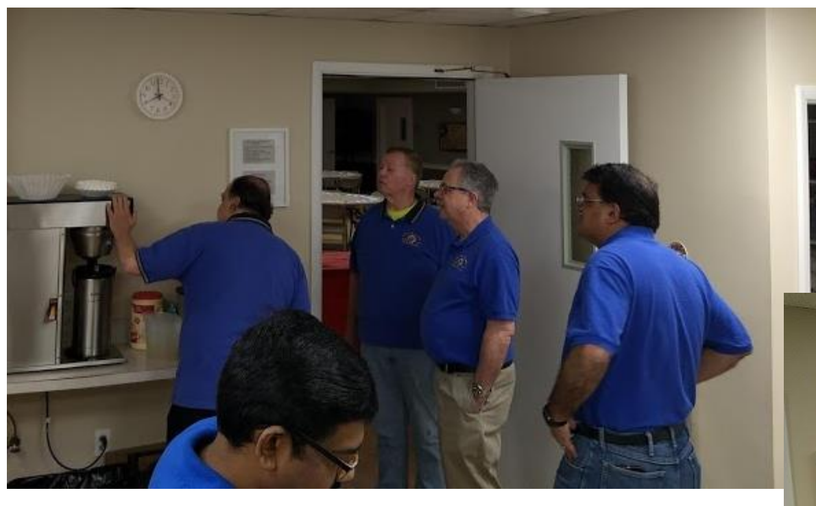
Training on how to make coffee in the big urn