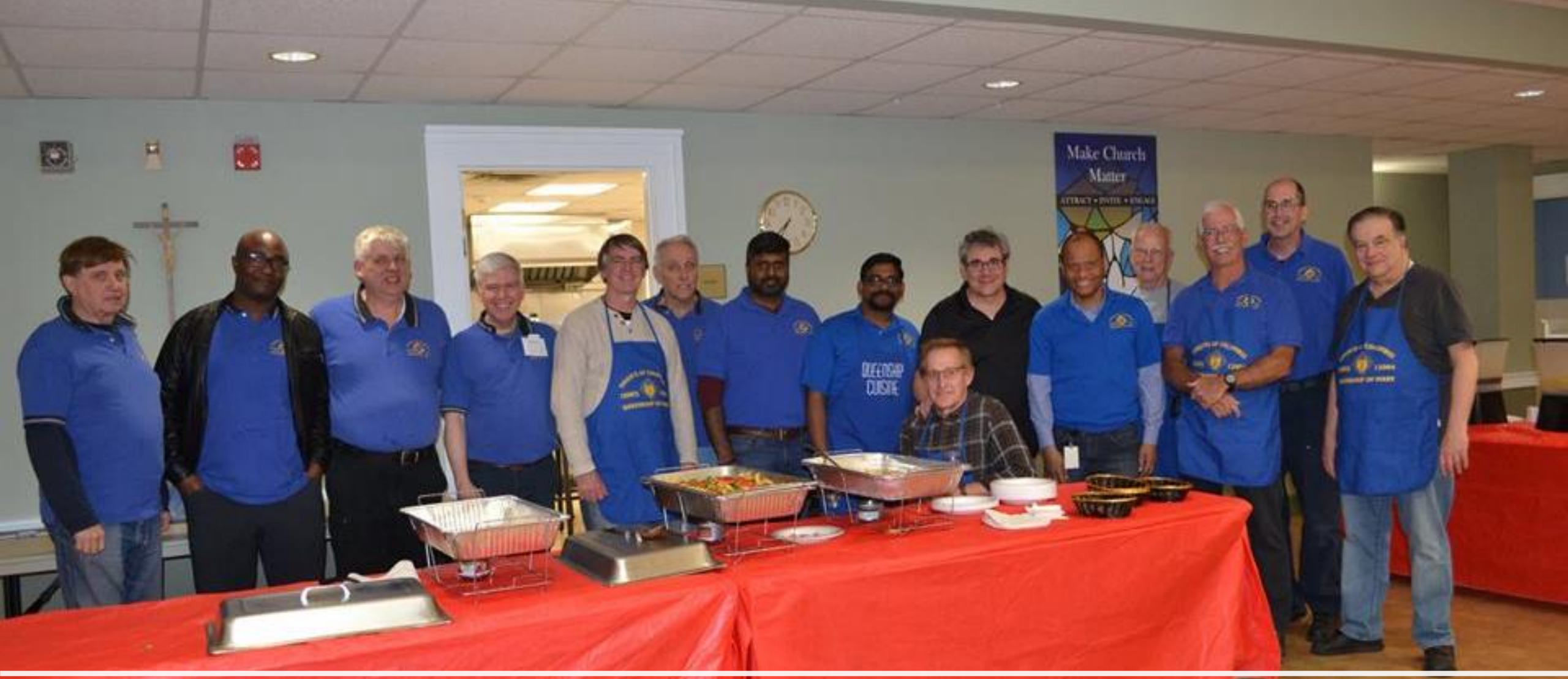
Grand Knight Report March 12, 2019